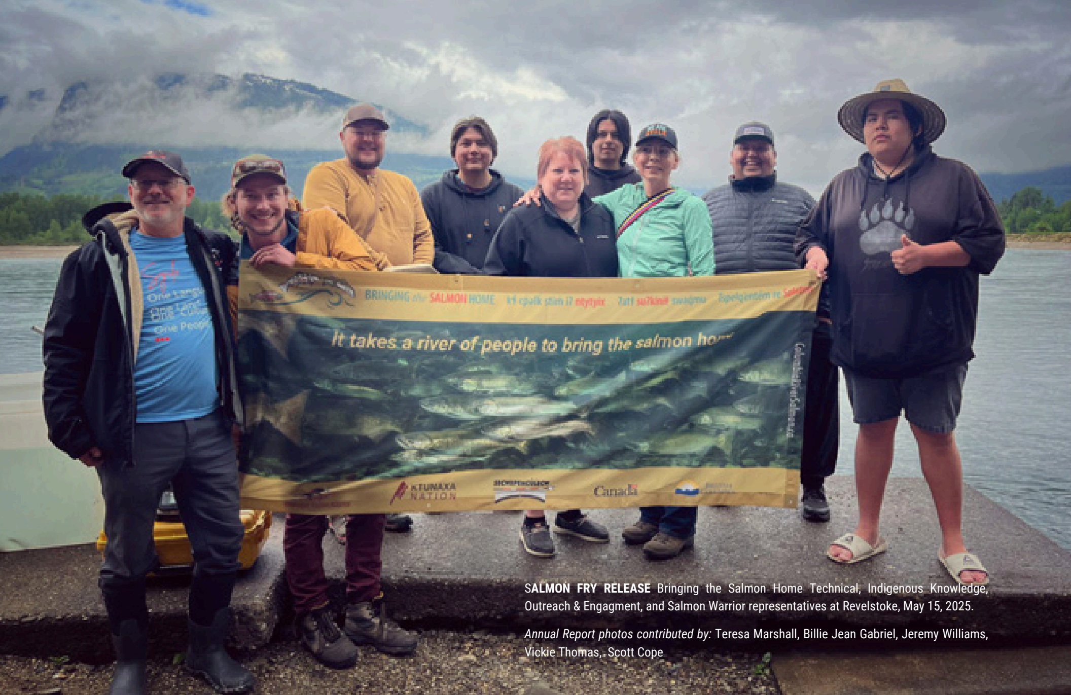
SALMON FRY RELEASE Bringing the Salmon Home Technical, Indigenous Knowledge, Outreach & Engagment, and Salmon Warrior representatives at Revelstoke, May 15, 2025.